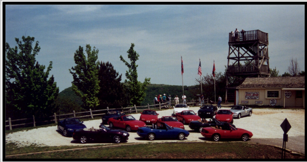
The cars parked at the Buffalo Valley overlook

It was a beautiful day for a wonderful drive. Fifteen cars and 29 people drove over to Arkansas to see the Buffalo Valley. The Buffalo Valley is beautiful. We lunched in Jasper and had a visit from the restaurant's pet, Coco, a brown bear (only in Arkansas). The drive was great, full of curves and hills. A big thanks to Earl and Dorothy for hosting the event.