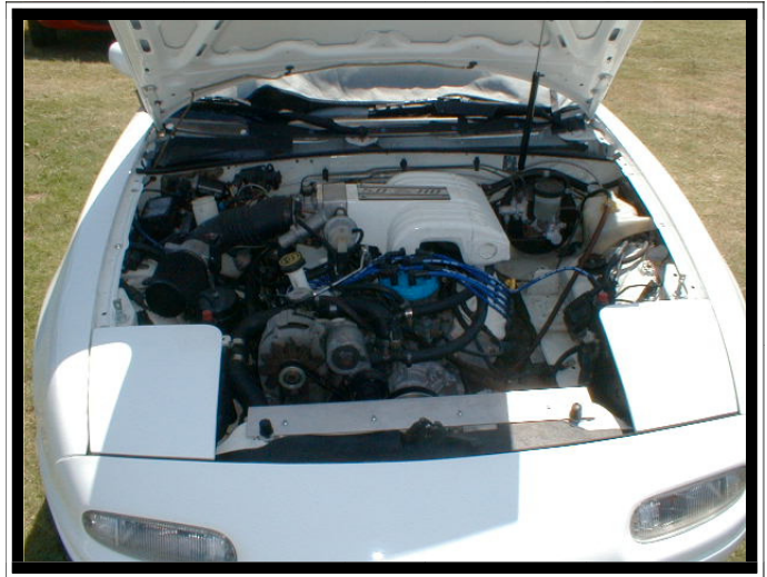
Miata with Mustang V8 Engine