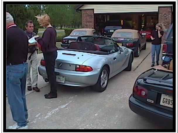
That's a Funny Looking Miata