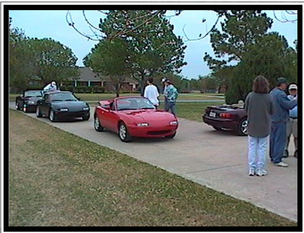
Getting Mentally Prepared (eating cookies)