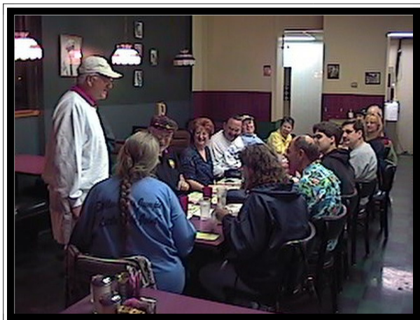
After the Hunt