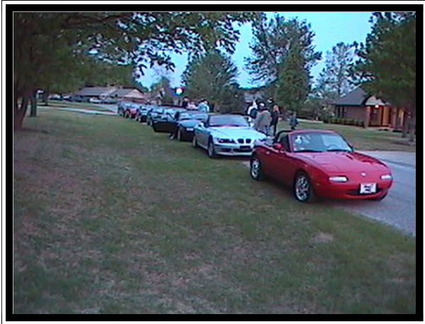
Ready for the Hunt!